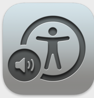
VoiceOver - Free Screen Reader built into macOS