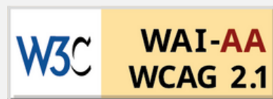
WCAG AA Level Accessibility